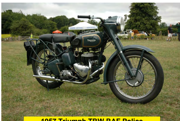
1957 Triumph TRW RAF Police