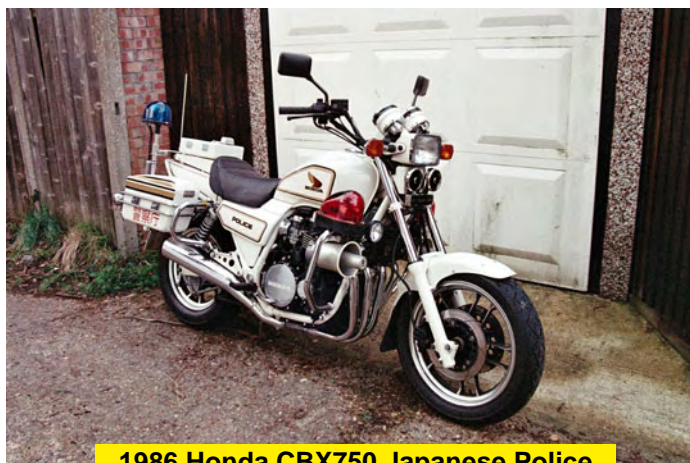
1986 Honda CBX750 Japanese Police