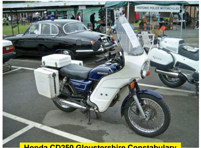
Honda CD250 Gloucestershire Constabulary