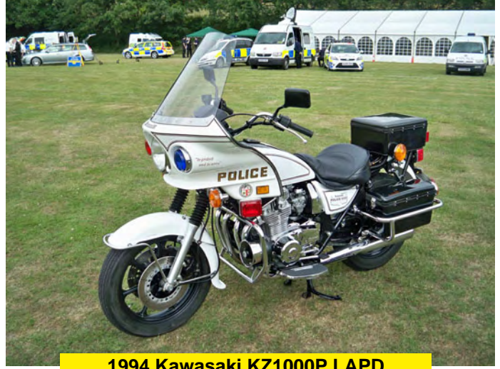
1994 Kawasaki KZ1000P LAPD