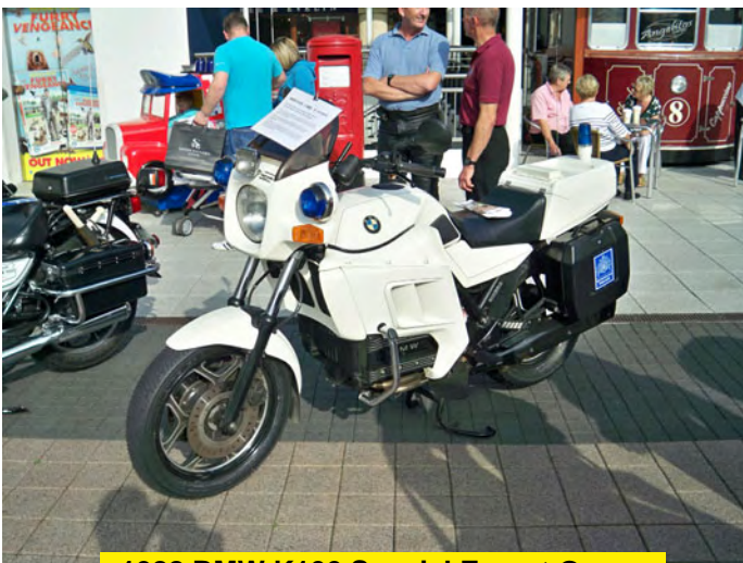
1988 BMW K100 Special Escort Group