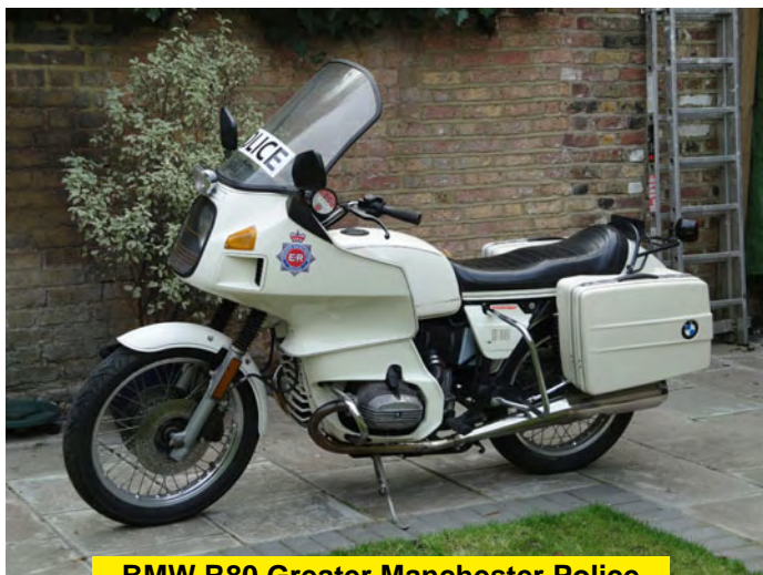
BMW R80 Greater Manchester Police