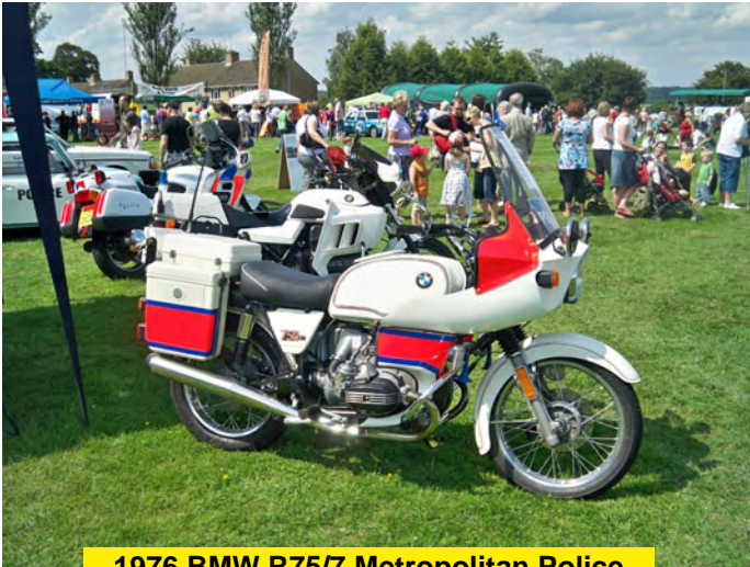
1976 BMW R75/7 Metropolitan Police