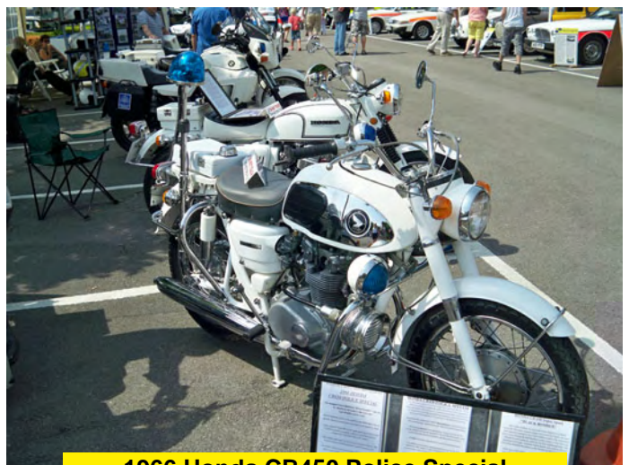
1966 Honda CB450 Police Special