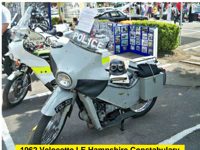
1962 Velocette LE Hampshire Constabulary