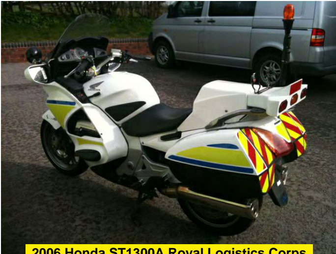
2006 Honda ST1300A Royal Logistics Corps