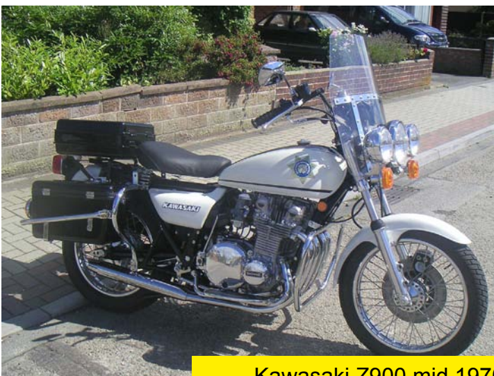
Kawasaki Z900 mid 1970's California Highway Patrol