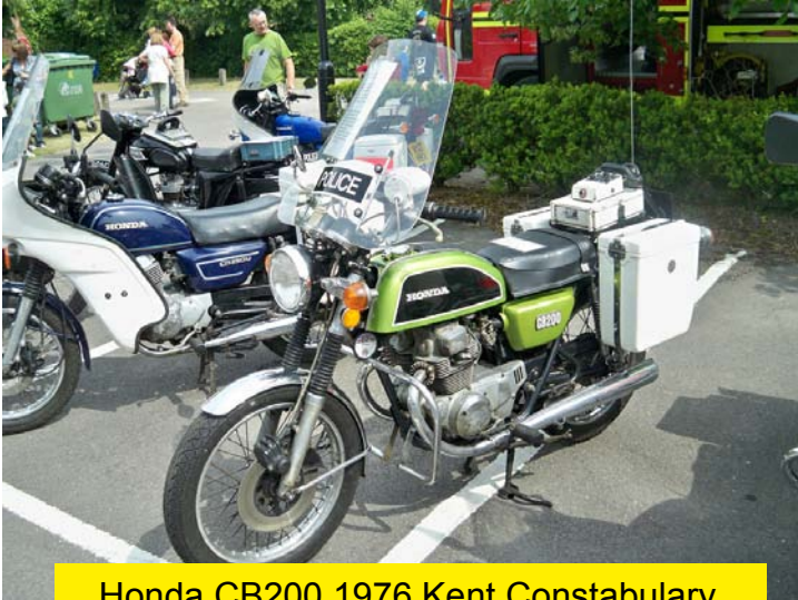
Honda CB200 1976 Kent Constabulary