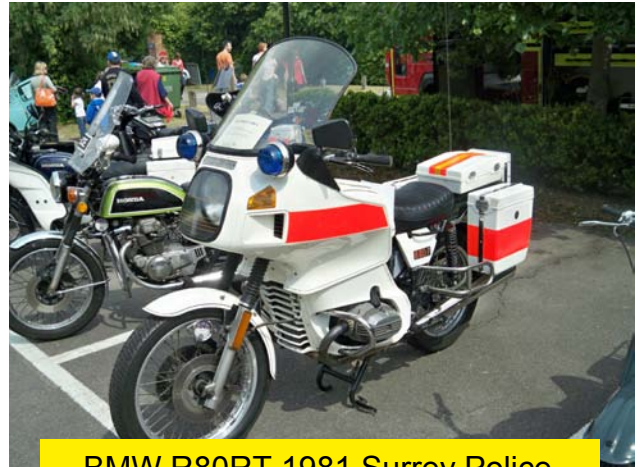
BMW R80RT 1981 Surrey Police