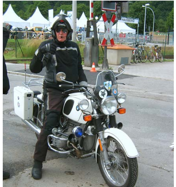
BMW R60/7 1977 French Gendarmerie