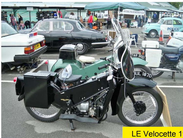
LE Velocette 1966 Metropolitan Police