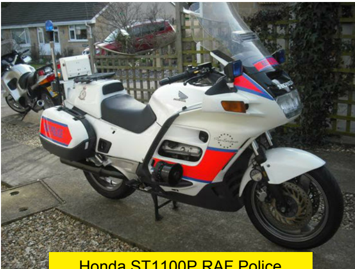
Honda ST1100P RAF Police