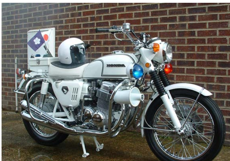
Honda CB750P 1969 Tokyo Police