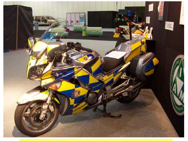
Yamaha FJR1300 - City of London Police