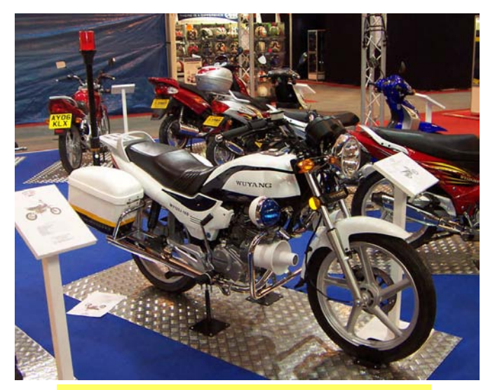
Wuyang 125 - Chinese Police Model