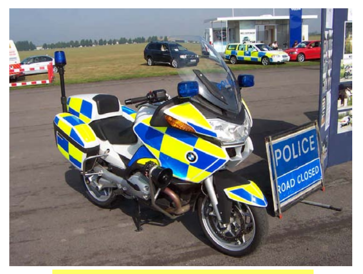
BMW R1200RT - BMW Demonstrator