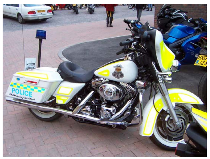
Harley Davidson FLHT - Susses Police Bikesafe