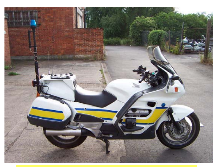
Honda ST1100 - Bomb Disposal, RAF Northolt