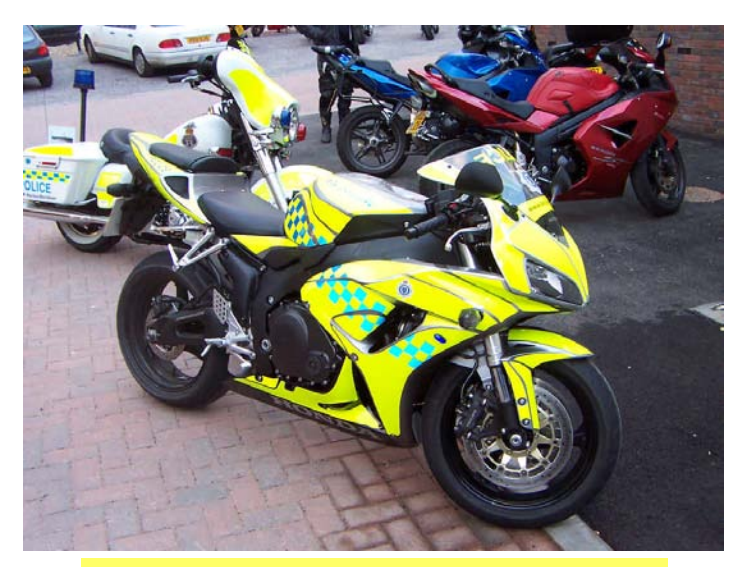
Honda Fireblade - Sussex Police Bikesafe