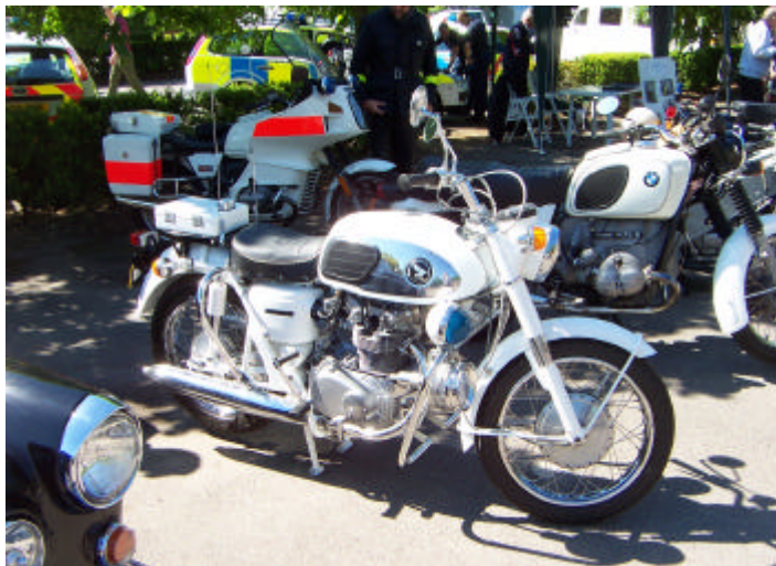
1965 Honda CB450P Japanese Police