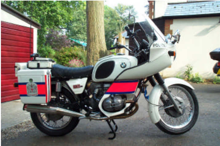
1976 BMW R60/6 City of London