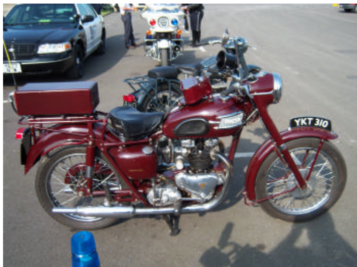
1957 Triumph Speed Twin Kent Constabulary