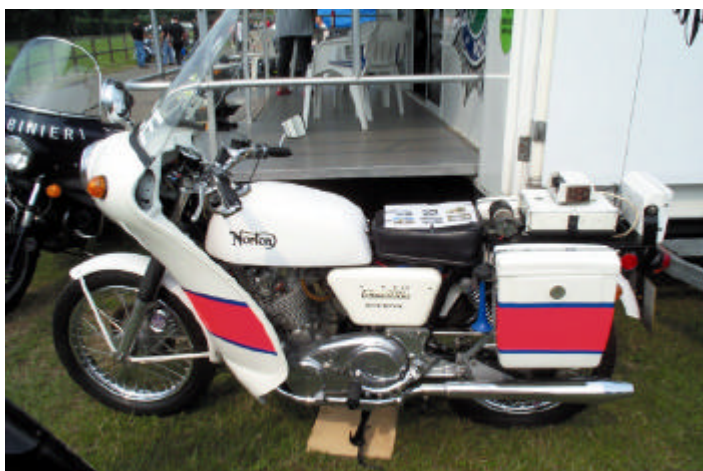
1972 Norton Interpol Lancashire Constabulary