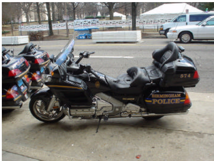
Honda GL1800 - Birmingham PD, USA