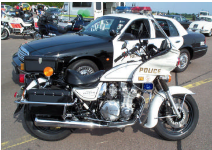
1994 Kawasaki KZ1000P Los Angeles Police Dept.