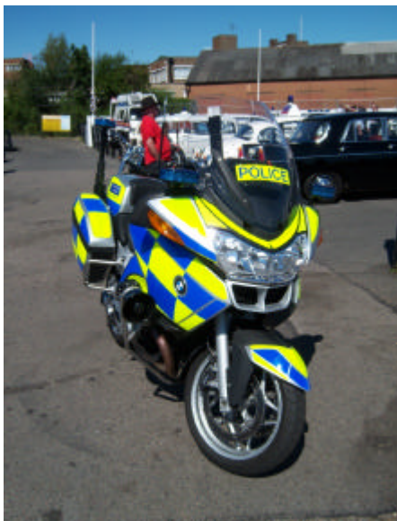
BMW R1200RTP - Metropolitan Police, London