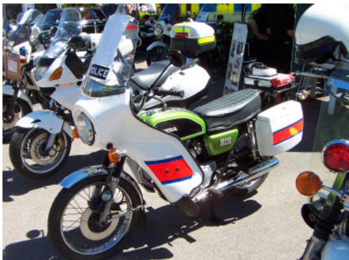
1982 Honda CB200 Hampshire Constabulary