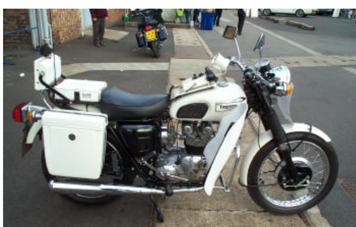
1974 Triumph T100P Metropolitan Police