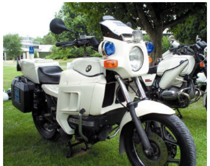
1988 K100 Special Escort Group Metropolitan Police

POLICE LINE - DO NOT CROSS - POLICE LINE - DO NOT CROSS - POLICE LINE - DO NOT CROSS - POLICE LINE