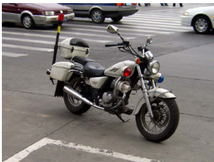
Suzuki 125 - Shanghai Police, China