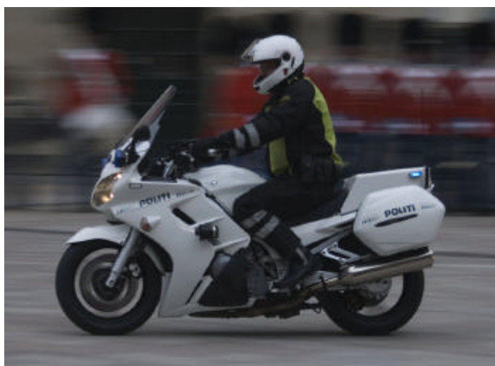
Yamaha FJR1300 - Finland

POLICE LINE - DO NOT CROSS - POLICE LINE - DO NOT CROSS - POLICE LINE - DO NOT CROSS - POLICE LINE