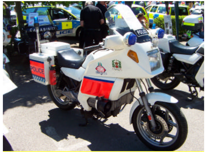
1989 K100RT Hampshire Constabulary