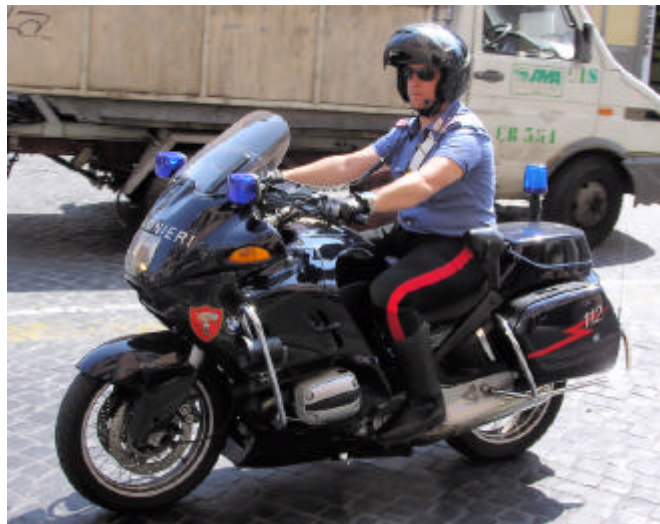
BMW R1150RTP- Carabinieri, Rome, Italy