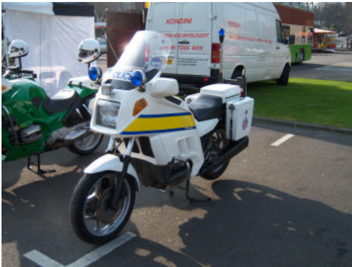
1990 BMW K75RT Kent Constabulary