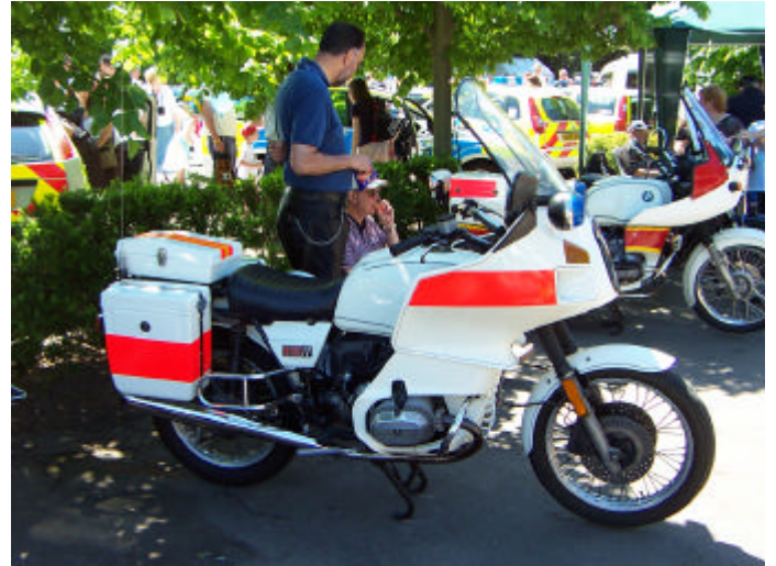
1978 BMW R80RT Surrey Police