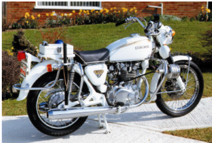
1970 CB450K5 Dubai Police, Saudi Arabia