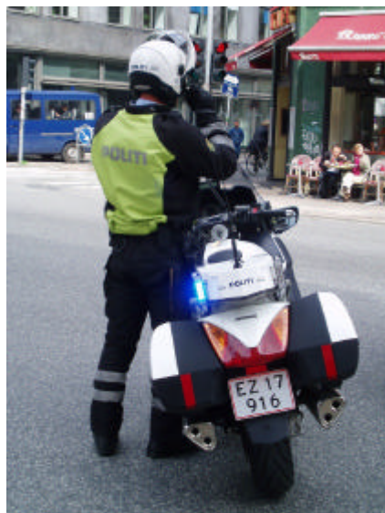
Honda ST1300 - Copenhagen Police