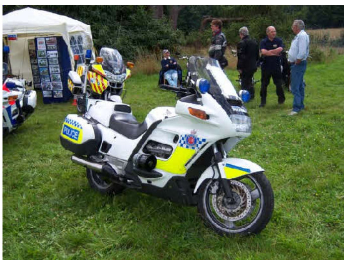
1994 Honda ST1100P Essex Police