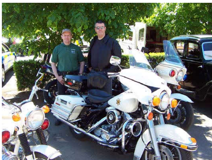
1997 Harley Davidson FLHTP US police model