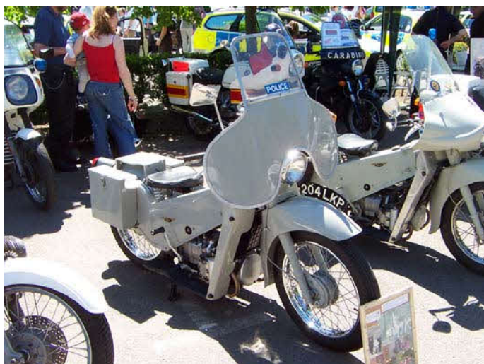
1960 LE Velocette Kent Constabulary