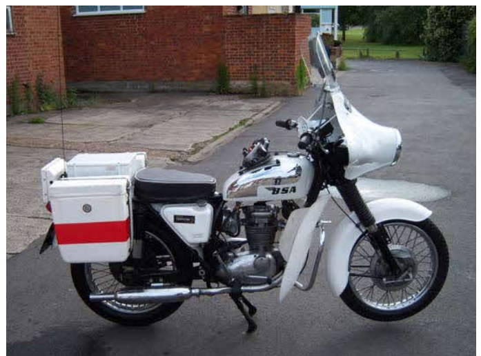
1969 BSA Fleetstar Gwynedd Constabulary

POLICE LINE - DO NOT CROSS - POLICE LINE - DO NOT CROSS - POLICE LINE - DO NOT CROSS - POLICE LINE