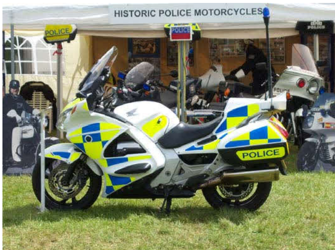
2001 Honda ST1300P - the first police pan produced