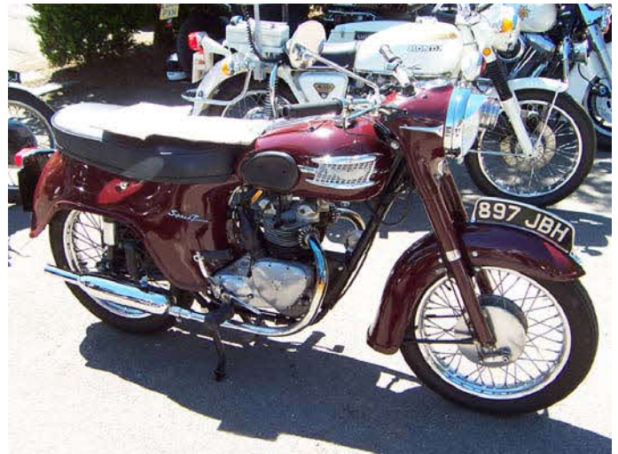
Triumph Speedtwin Buckinghamshire Constabulary