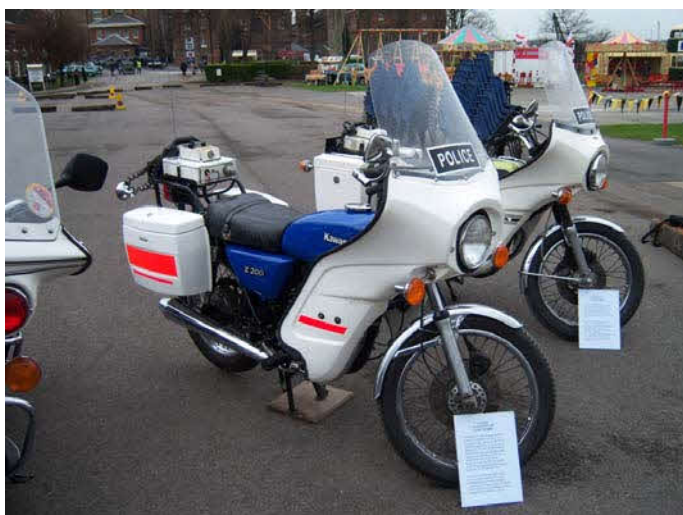
1981 Kawasaki Z200 Kent County Constabulary