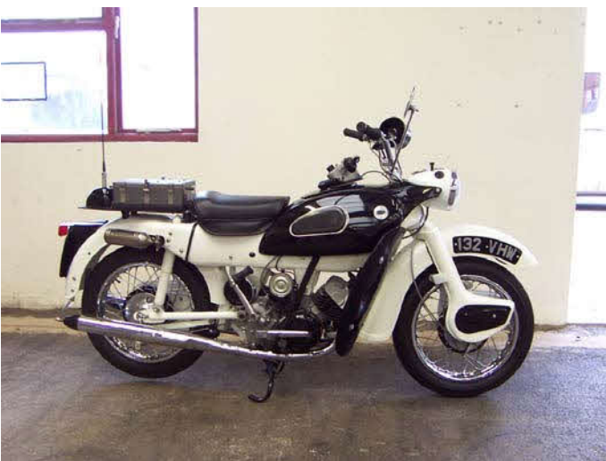
1961 Ariel Arrow Police model