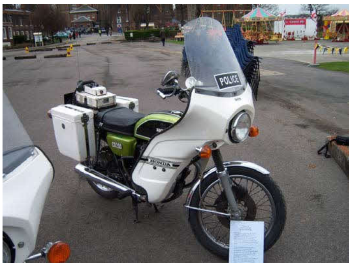
1976 Honda CB200 Kent Constabulary