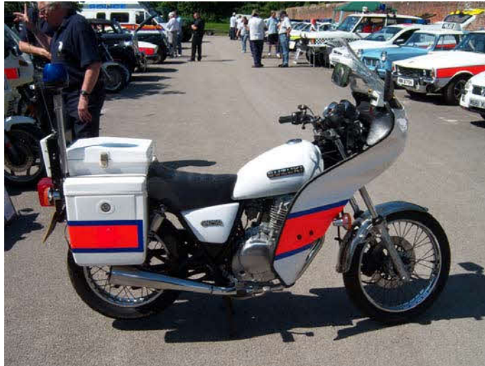
1995 Suzuki GN250 Herefordshire Constabulary

POLICE LINE - DO NOT CROSS - POLICE LINE - DO NOT CROSS - POLICE LINE - DO NOT CROSS - POLICE LINE