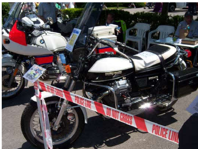
1978 Moto Guzzi 850T3 US police model

POLICE LINE - DO NOT CROSS - POLICE LINE - DO NOT CROSS - POLICE LINE - DO NOT CROSS - POLICE LINE