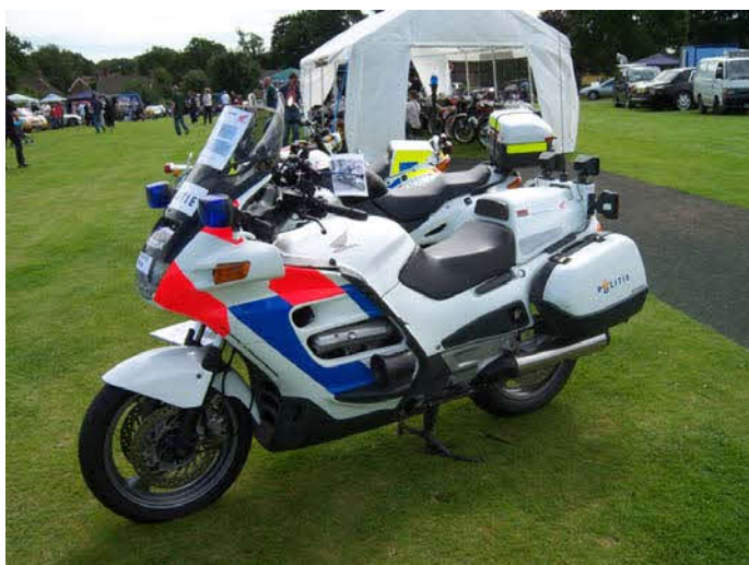
1998 Honda ST1100P Dutch Politie