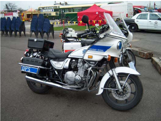
Kawasaki KZ1000P Arizona Public Safety