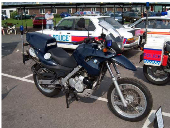
2000 BMW F650 City of London Police