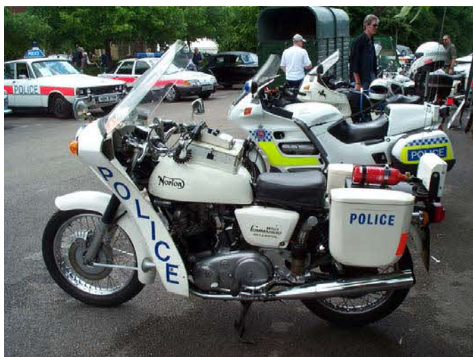
1974 Norton Interpol Hampshire Constabulary