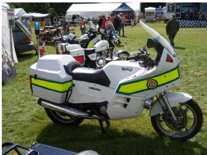
1990 Norton Interpol II London Ambulance Service