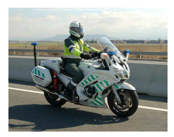
FJR1300P Guarda Civil, Spain