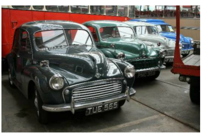
Horse drawn buses, Moggies and Milk Floats. What else would you expect?