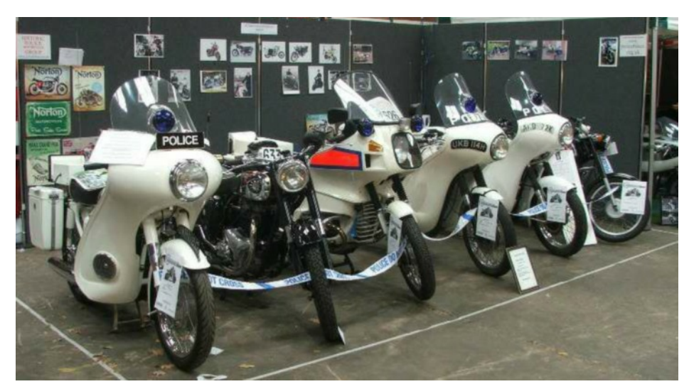
The October 2015 line-up in Side Hall 2 at Stafford. It was rather a tight squeeze with six bikes as it was supposed to be enough for eight or nine. ( Left to right ) 1968 Norton Atlas 750cc; 1961 BSA A10 Gold Flash 650cc; 1982 BMW R80 TIC 800cc; 1969 Triumph Saint 650; 1972 Norton Interpol 750 and a 1975 Jawa engined 250cc CZ. We also had a Kawasaki KZ1000 at the back.

With two shows a year and only one newsletter, it's easy to forget to do a write-up sometimes.