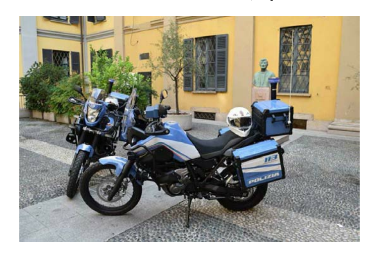
XT660Z Polizia Municipale, Italy