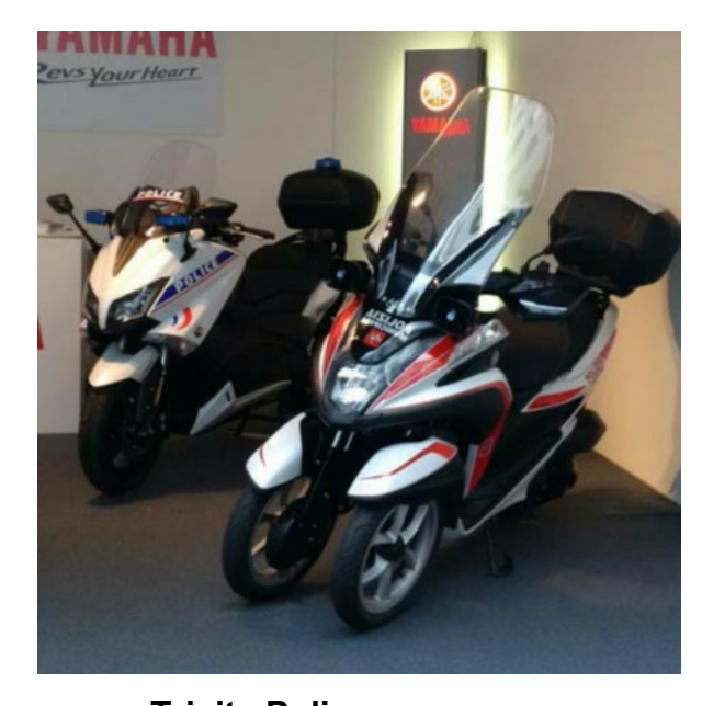
Tricity Police spec

Thanks to Yamaha Motor UK for the pictures.