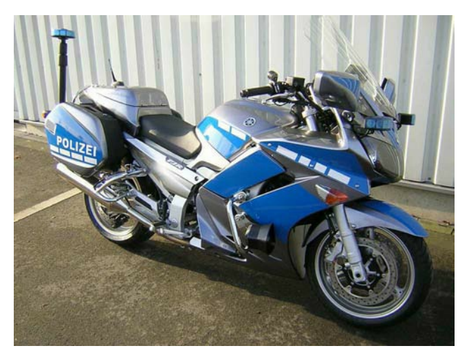
FJR1300P Polizei, Germany

new range of Yamaha Police motorcycles and scooters were shown at the Milipol Trade Show in Paris late last year. Milipol is Europe's largest trade show for military and vehicles. Yamaha police have been developing and supplying police specification motorcycles since 1987. The latest lineup includes the flagship FJR1300P, the XJ6 and the new MT-09 Tracer, seen for the first time in police colours. All the models are available from the Iwata factory in Japan and are then fitted out by the local (Country) branches of Yamaha to follow their own countries specific requirements.