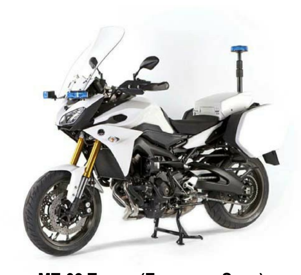
MT-09 Tracer (European Spec)