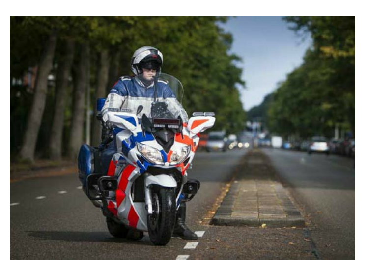
FJR1300P KMAR, The Netherlands