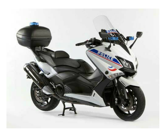
TMAX (European Spec)