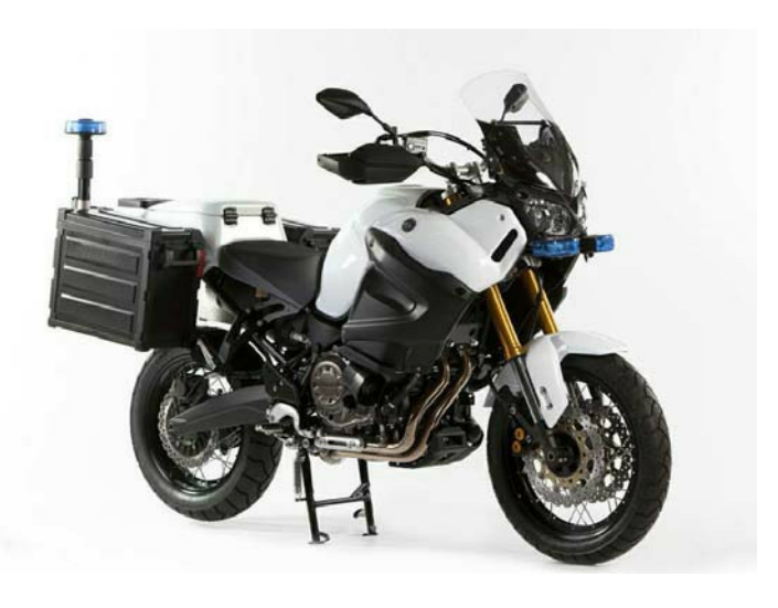
XT1200Z (European Spec)