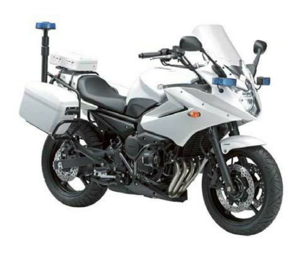
XJ6 (European Spec)