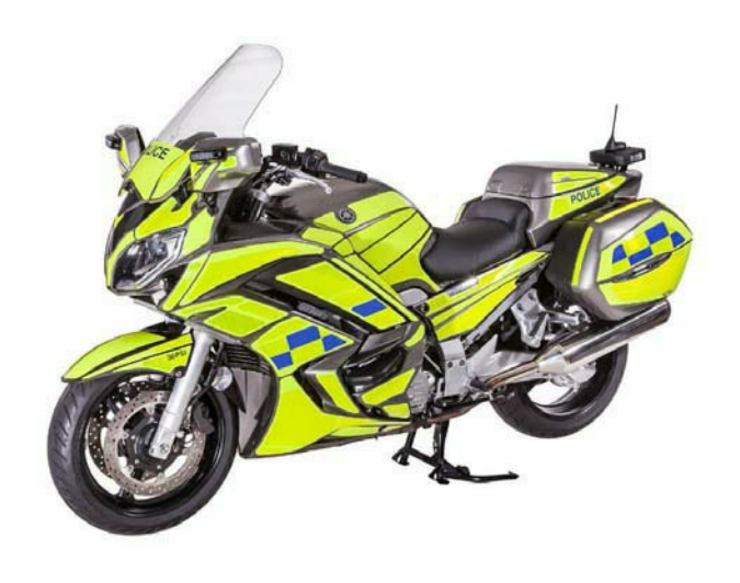
FJR1300P (UK Spec)