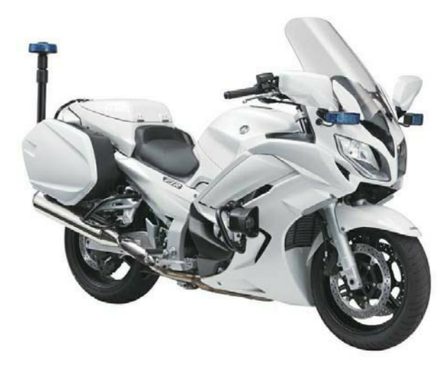
FJR1300P (European Spec)